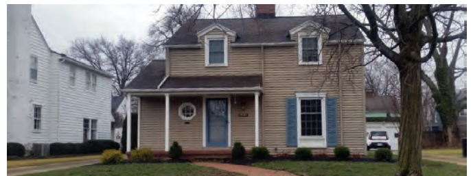
Maintenance of two parsonages