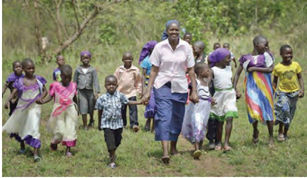
Support for a United Methodist missionary in Africa