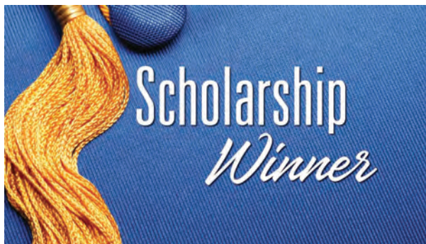
Scholarships given out to RRUMC youth active in their faith.