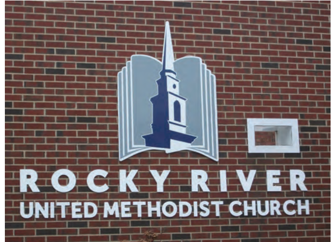
Gutters cleaned and trees were trimmed to assure overall maintenance of the main church building